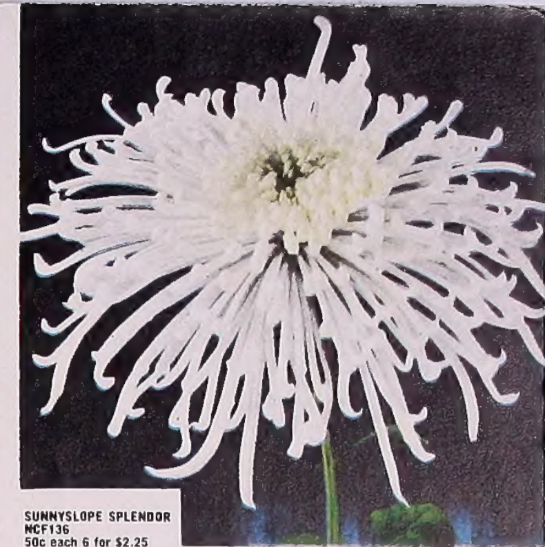
SUNNYSLOPE SPLENDOR NCF136 50c each 6 for $2.25

NCF131 RUBY — Raspberry-red spider; large tubular petals. Vigorous grower.